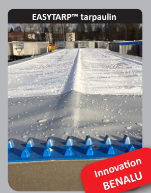
EASYTARP™ electric tarpaulin totally automated by radio control. (Patent no. EP2878551)