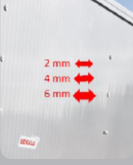
Internal part of the wall of varying thicknesses so as to respond ideally to each type of load.