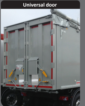
Universal single-wall door o varying thicknesses with closure by bolts and optional inspection hatch