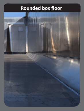
Limits the retention of the retention of product for tipping and encourages