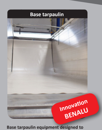
ease the flow of products that are sticky and ensure total safety (Patent no. FR2976532)