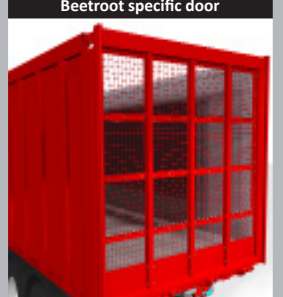
Innovative door, specifically design to transport beetroot.