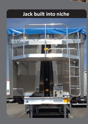
Jack with built-in eye in niche which optimises the total volume.