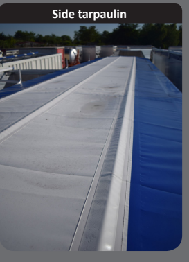
Side tarpaulin for fastening by straps suitable for all types of door.