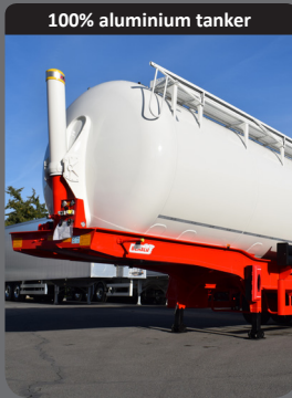
100% aluminium tanker

Straight rear part that offers a gain of volume, of ground clearance and an improvement of the overhang