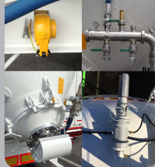
Specific equipment: food, chemicals and minerals

Various pieces of equipment specific to each type of transport (valves, filters etc.)