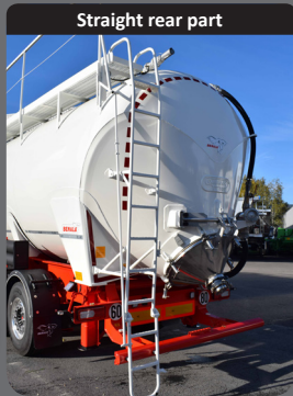
Straight rear part

Improved axle centre distance and structure providing the best stability on the market.