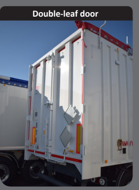
Single double-leaf rear door closure having remote locking and a reinforced frame.