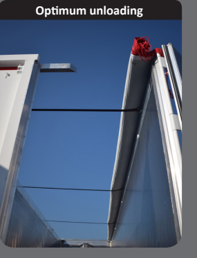
Door opening without beam that ensures total removal when unloading.