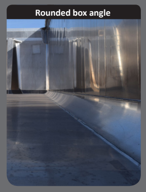
Rounded angles that limit retention of the product when tipping and encourages run-off.