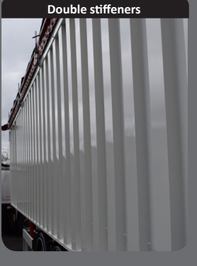
Box profile with double stiffeners on the rear section, providing