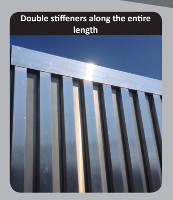
Double stiffeners on the entire sides to improve strength.