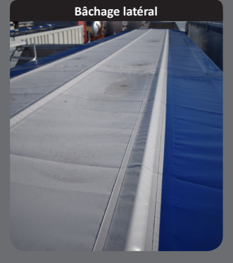
Tarpaulin with manual side winding of varying thicknesses.