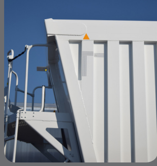
Reinforced upper part with an edge of 260mm high on more than 65 mm