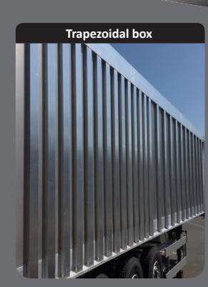
Trapezoidal shaped box whic optimises volume and eases run-off of the product.