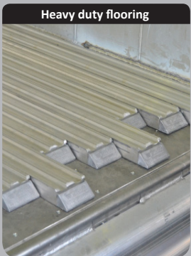
Heavy duty flooring

Reinforced floor (smooth or corrugated) 10mm thick or HDI 8/18 very high impact resistance (overlapping floor also available)