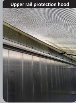
Upper rail protection hood

Butterfly cover with hydraulic or manual control equipped with a net (4x4 mm mesh)