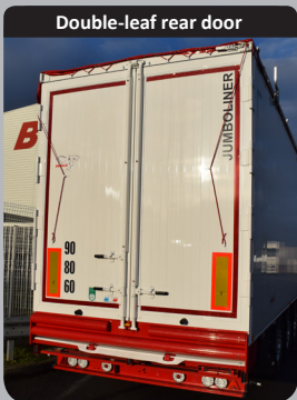
Double-leaf rear door

Half built-in double-leaf door (2 bolts). Continuous welds and continuous side bumper on box for docking.