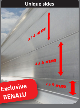
A unique thickness gradient! The "double skin" technology allows the nternal thickness to be varied over the height of the vehicle.