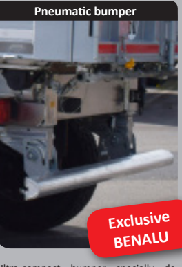
Ultra-compact bumper specially designed to suit the finisher.