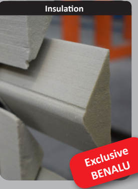
Insulation technology specially designed for our double skin walls!