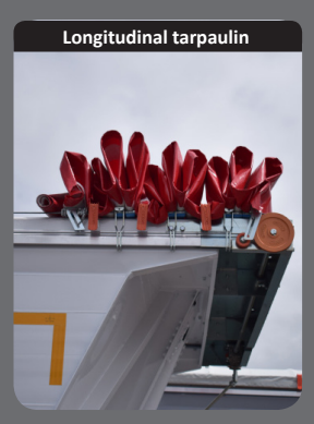
Longitudinal tarpaulin by manual or electrical control cable.