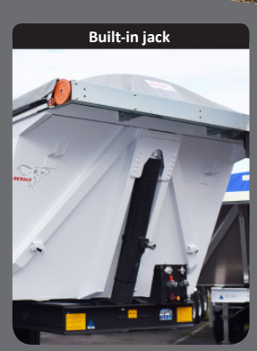
Jack with a lug firmed fastened which guarantees robustness suitable for building and public works.