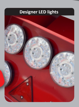
Full LED lights which are low energy and have a particularly successful design.