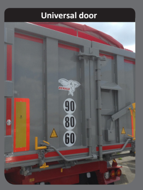
Optional universal door with bolts and