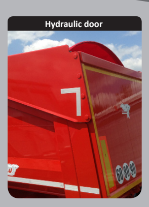
Single- or double-acting hydraulic door with a large opening angle.